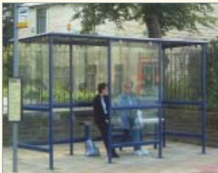
A solar-powered bus shelter in Burnley, Lancashire

In conjunction with a local community initiative which has provided a footpath between the station and the village, one of the first solar powered bus shelters in the County will be provided at the station. This will provide a safe waiting facility for travellers and improve integration between bus and rail.